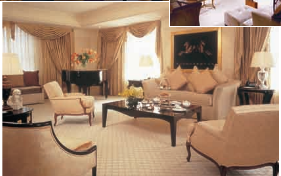
The Peninsula Suite includes a bedroom, (top left); a dining room (top center), bathroom (top right) study (middle right), and sitting room (bottom right).