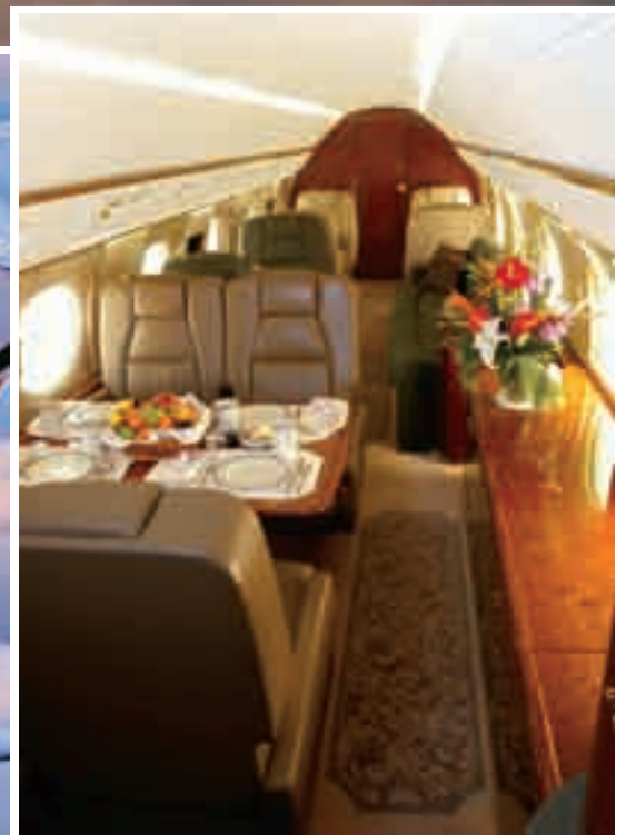
Marquis has access to a fleet that includes the Boeing Business Jet (top); and the Gulfstream 400/450 (left and above).